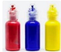
Primary coloured paint